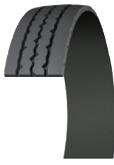
MICHELIN® and Oliver® Retreads