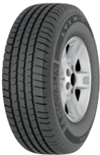
Passenger Car and Light Truck Tires