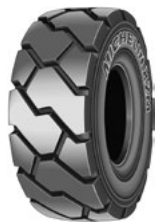
Compact Line Tires