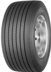
MICHELIN® New X One® Truck Tires